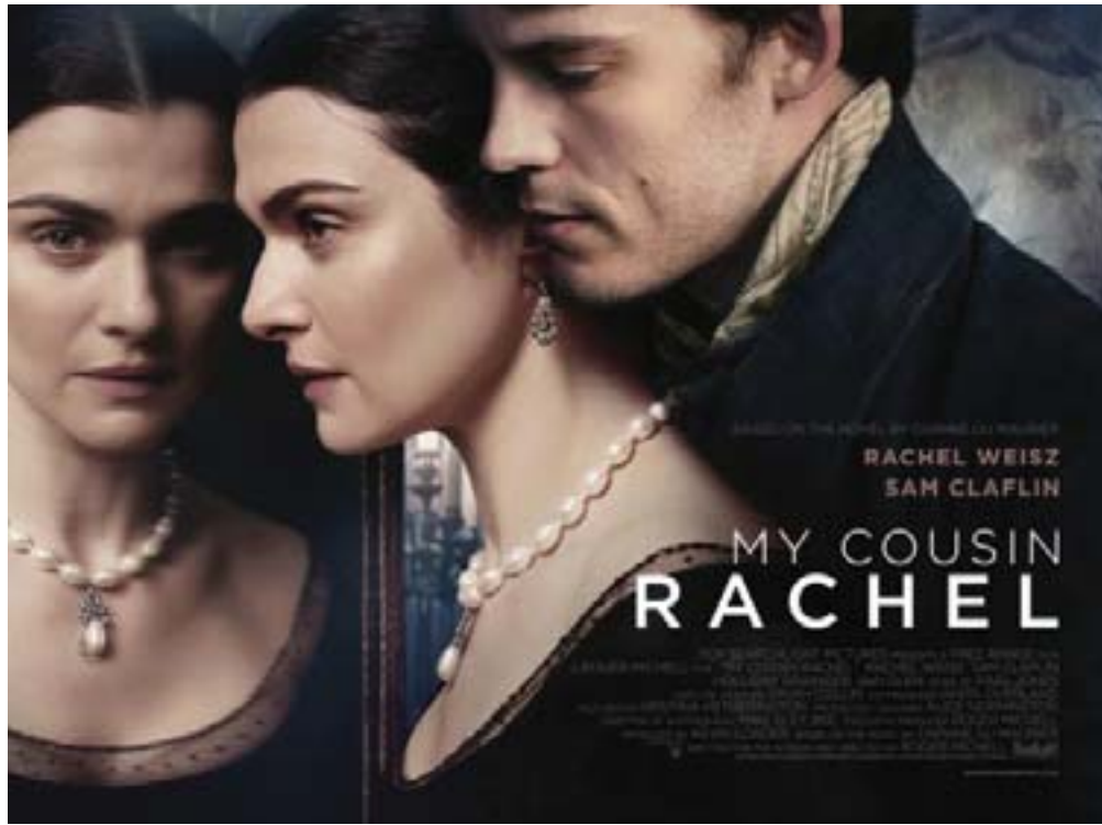
Oscar-winner Rachel Weisz stars in "My Cousin Rachel."

"My Cousin Rachel" begins its two-week run at the Orinda Theatre on June 16. A remake of the 1952 original starring Richard Burton and Olivia de Havilland is based on the Daphne Du Maurier novel of the same name.