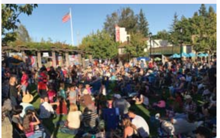
Some dancing at a concert last year at Moraga Commons.